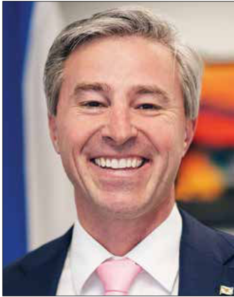
Premier Tim Houston