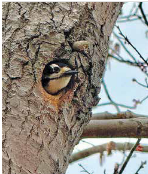
Hairy Woodpecker nesting in the Backlands Photo Catherine Slone, May 2026

servation efforts in the Williams Lake watershed and the Backlands.