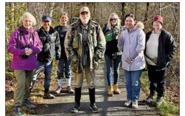
Birders on Hartlen Park Trail in McIntosh Run Community Trails

For more information on our annual bird walks check out the library's website and follow WLCC website and social media on our con-