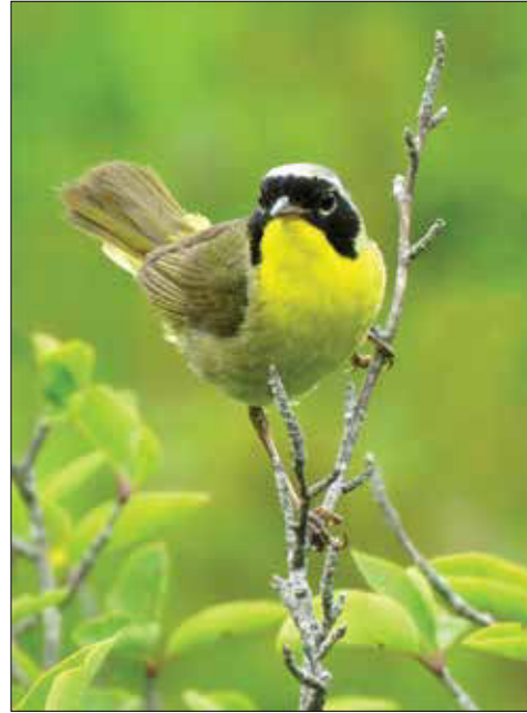
Common Yellowthroat in the Backlands, May 2026