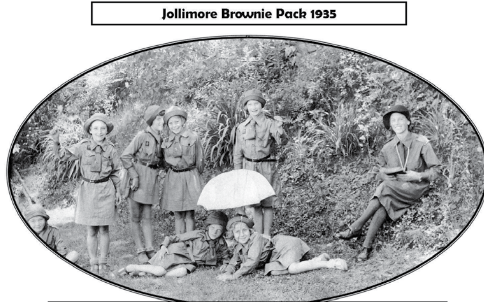
Jollimore Brownie Pack 1935

The junior division of the North West Arm Hockey League was made up of teams from Jollimore, Pur-