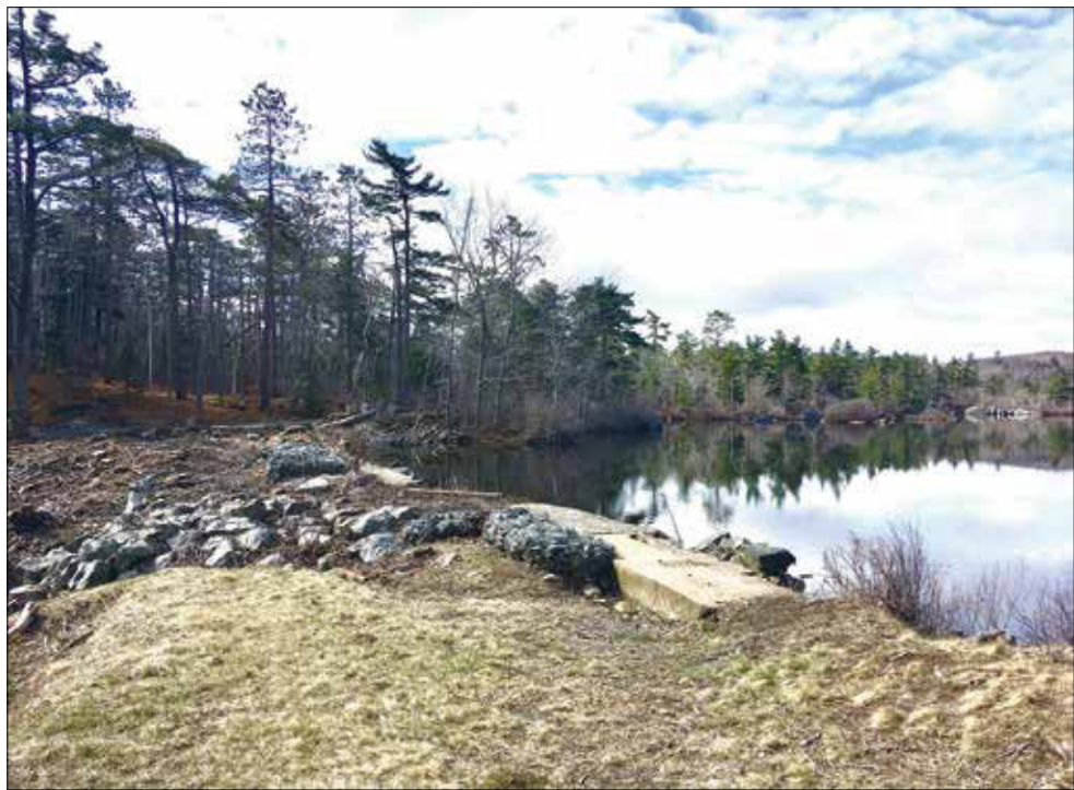
Preparations have begun to replace the old Williams Lake dam