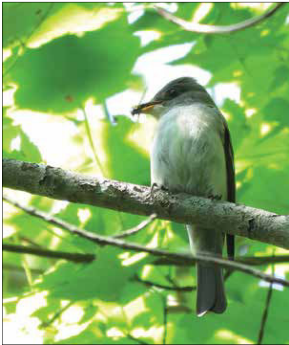
Eastern Wood-pewee, of the flycatcher family, with lunch