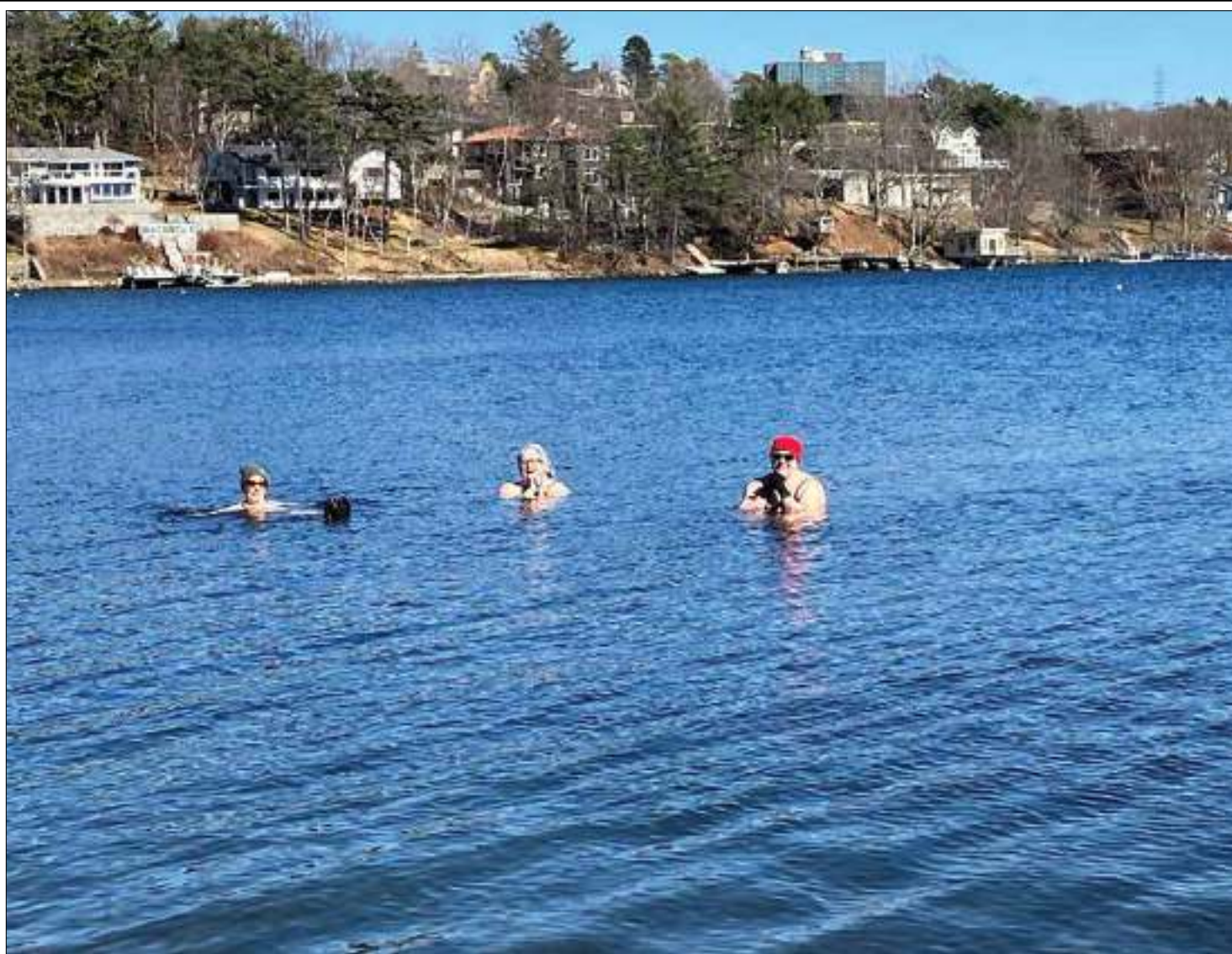
Members of Cold Play Nova Scotia enjoying a 5 to 7 minute Cold Plunge in the waters off The Dingle on March 22nd. Cold Plunging, or cold-water immersion, involves briefly submerging yourself in cold water, typically for a few minutes, and is gaining popularity for its potential health benefits, including muscle recovery and improved mood.

games night. It didn't turn out to be as popular as we had hoped. The few that were there really enjoyed themselves plus the volunteers tried out all the different games. I'd say we all had fun.