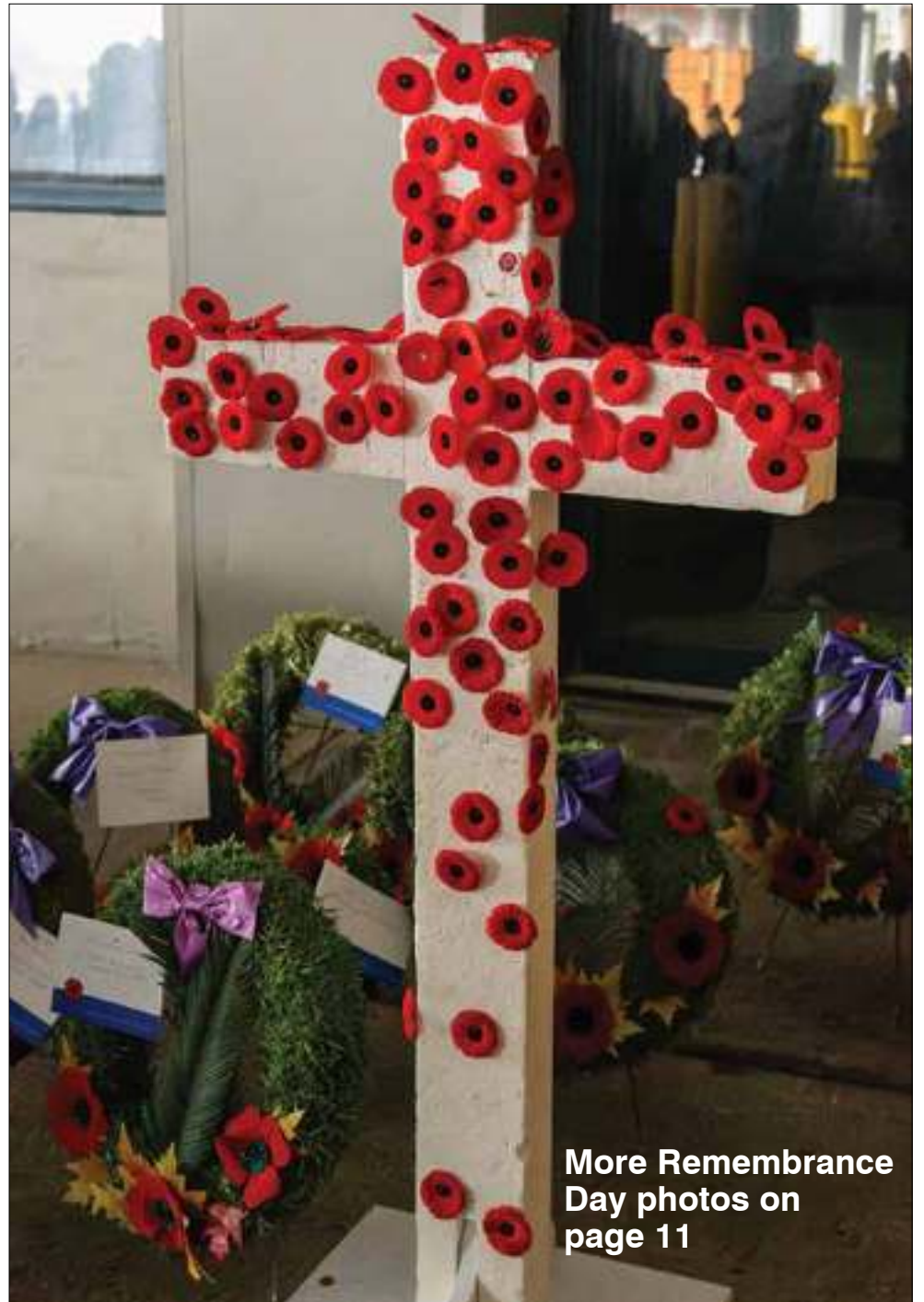
More Remembrance Day photos on page 11