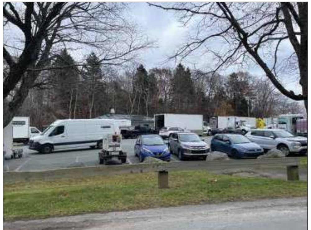
The popular TV Series "Sullivan's Crossing" were shooting scenes for season 3 at the Dingle during November