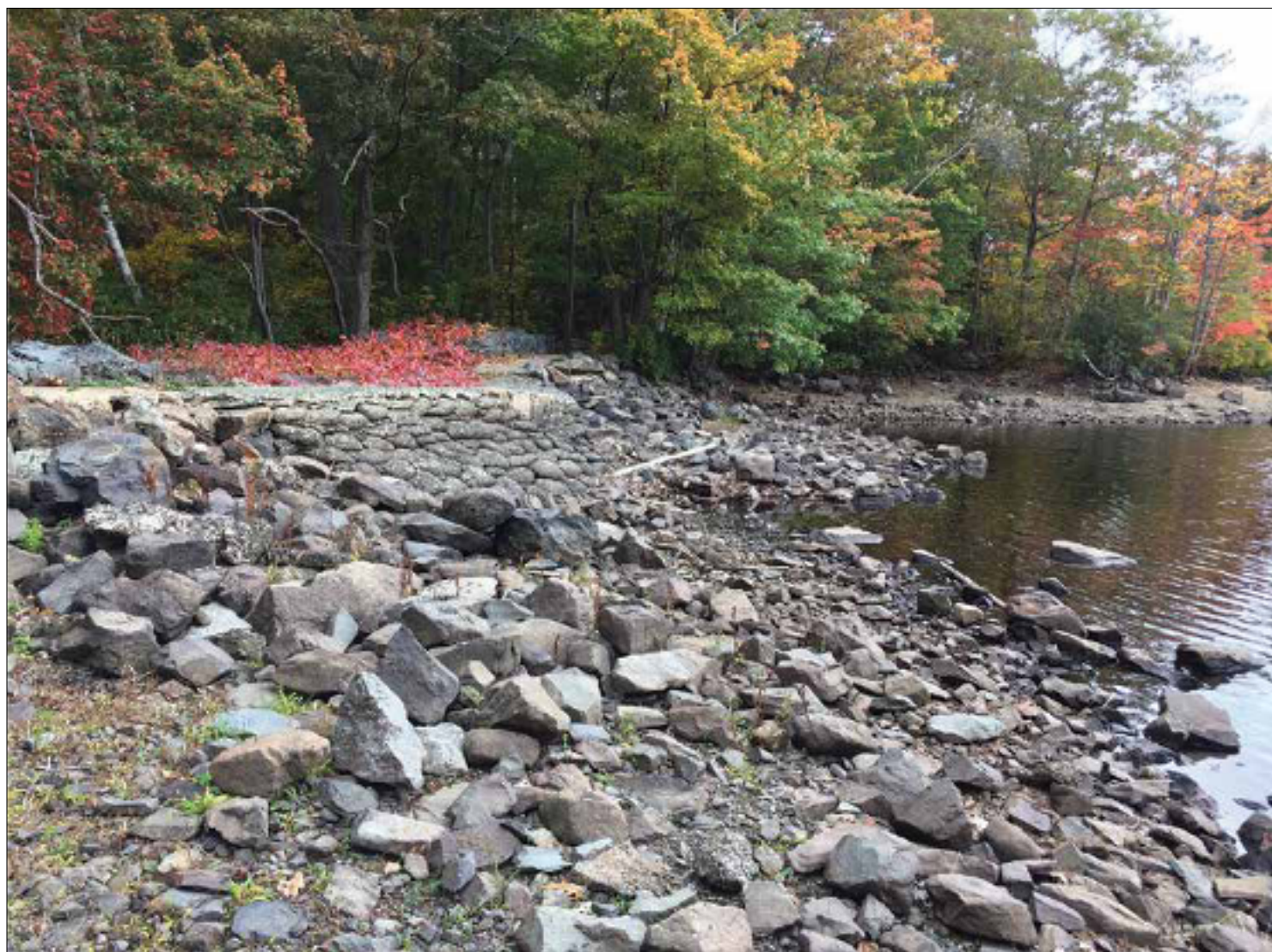
Williams Lake dam – looks like a dam but doesn't act like a dam. October 2021