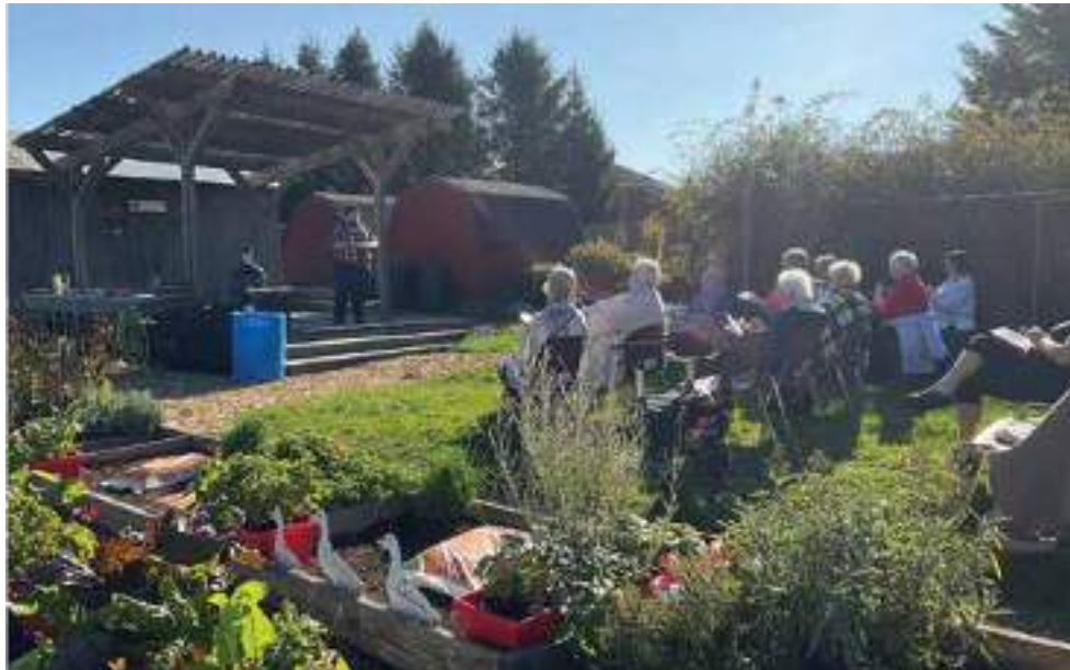
Sunday service in the garden

Continuing with FRI, they are currently taking registration for Christmas support. If you are interested in looking