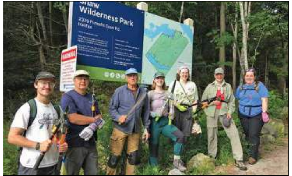
Weed Warriors at Shaw Wilderness Park, August 2024.