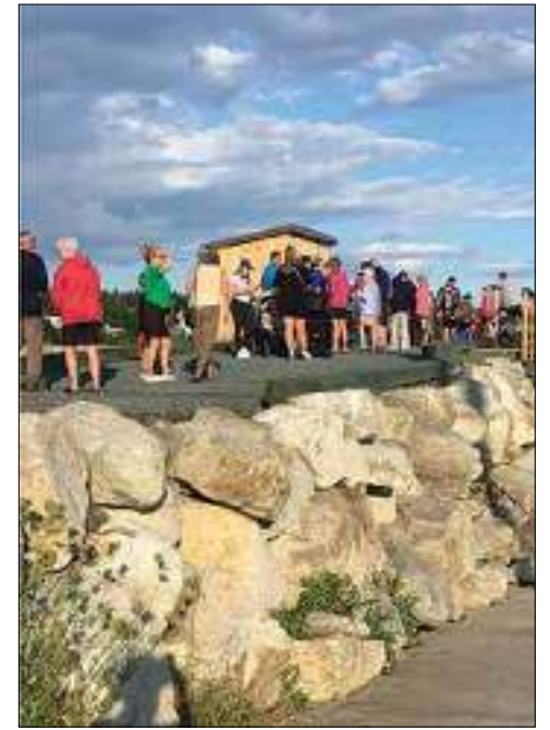
Ketch Harbour Community Wharf Ice Cream Social, August 2024.

The World Meteorological Organization recently retired the name "Dorian" from their list of storm names never to be used again to name an Atlantic tropical cyclone.