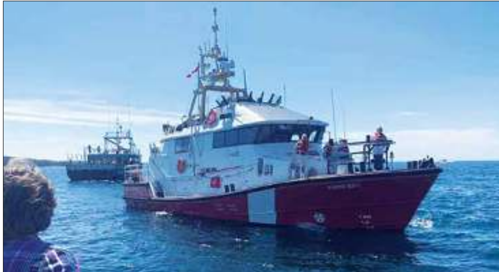
Blessing of the Fleet