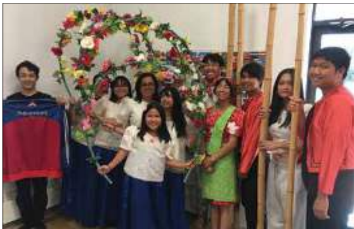
Philippine Bamboo Folk Dancers