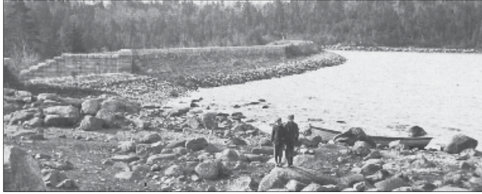
Photo: Long Lake Dam Reconstruction, 1922. From Private Family Collection, courtesy Mainland South Heritage Society

Fairbanks wrote of the many valuable instruments he made, such as the drill hammers made of cast steel, a material, he said, that was not used before but now no other is used for the same work. Another of his inventions, the improved form of wooden wedges to join water pipes, became of great