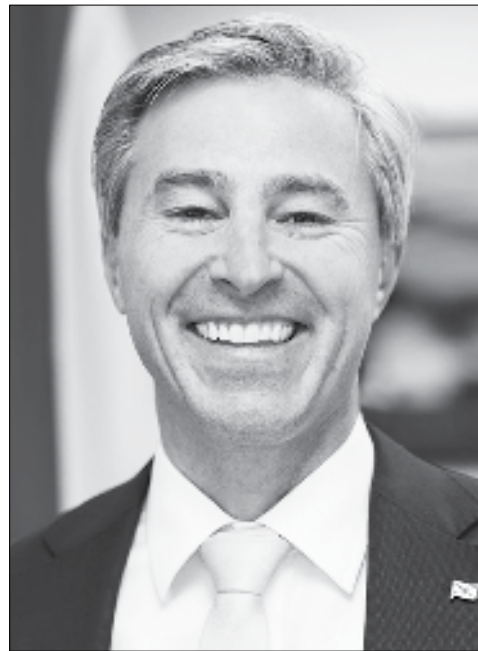
Premier Tim Houston