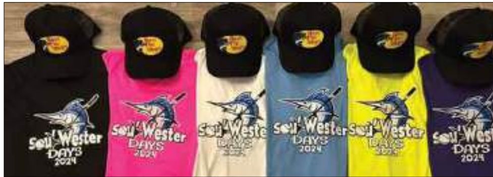
Kids ball uniforms