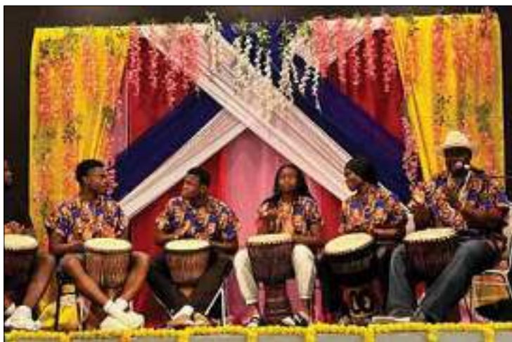
The Halifax Multicultural Drummers