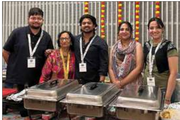
Spryfield Area Multicultural Society's food table.