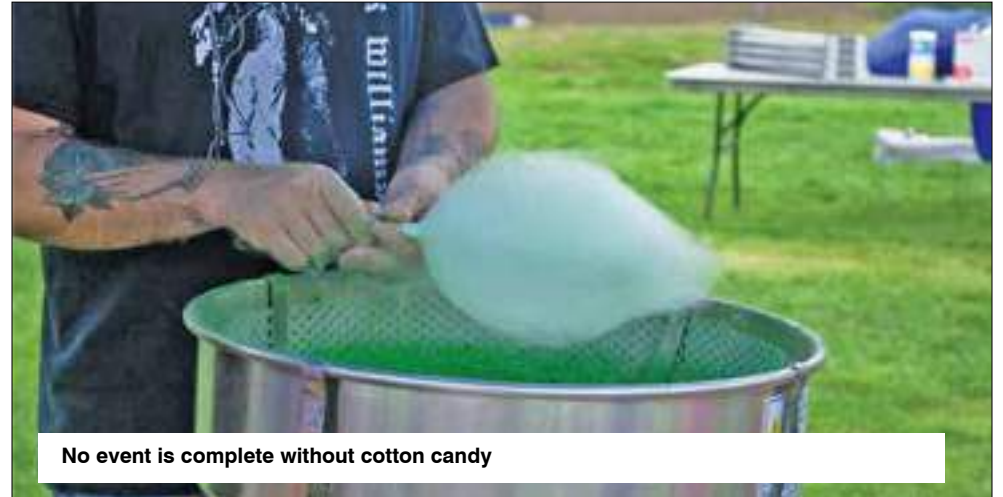
No event is complete without cotton candy