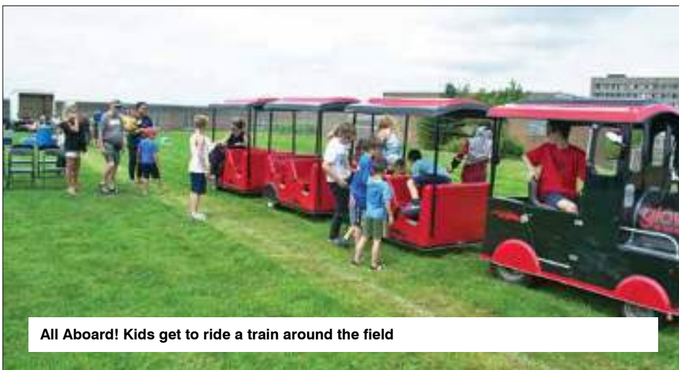
All Aboard! Kids get to ride a train around the field