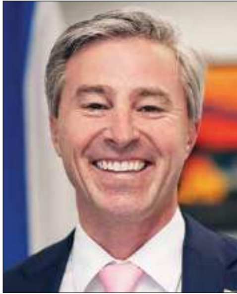
Premier Tim Houston

ernment did was offer a job to every graduating nurse in this province. I met with nursing students and was surprised to find that even with over a thousand vacancies, nurses were struggling to get hired.