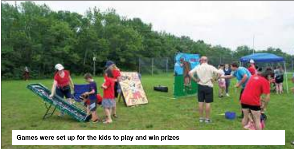
Games were set up for the kids to play and win prizes