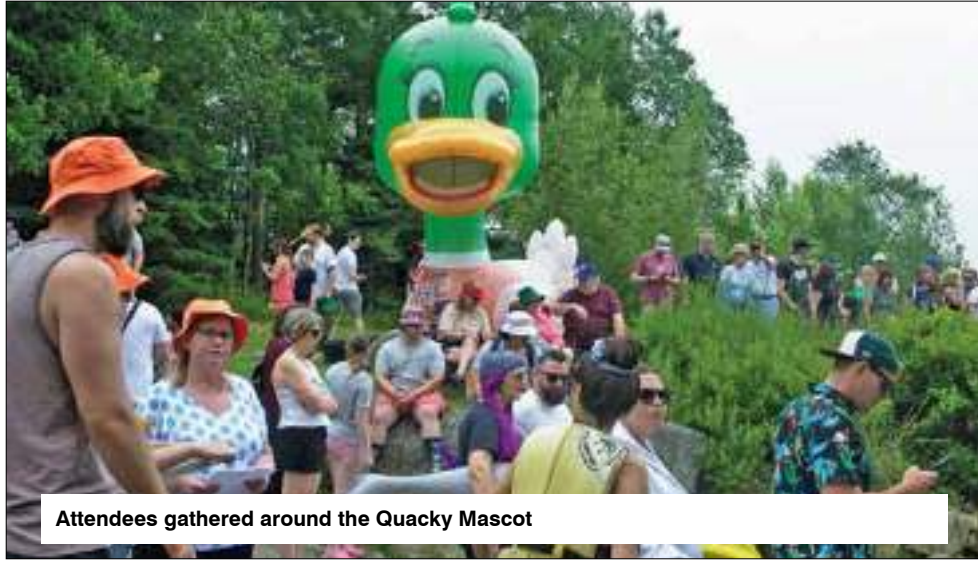
Attendees gathered around the Quacky Mascot