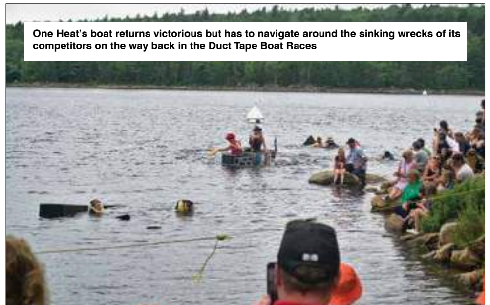
One Heat's boat returns victorious but has to navigate around the sinking wrecks of its competitors on the way back in the Duct Tape Boat Races