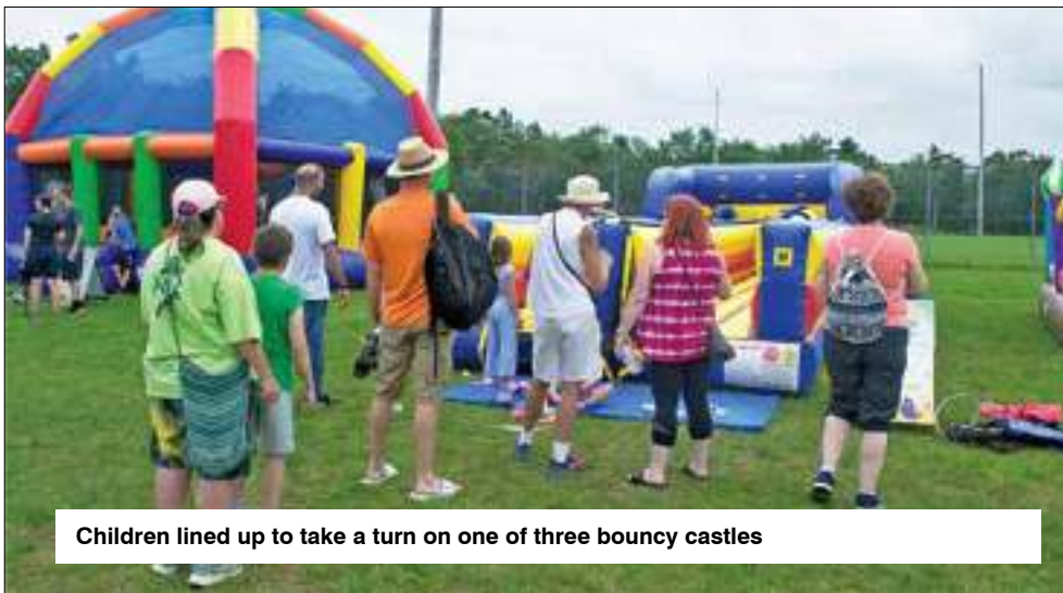
Children lined up to take a turn on one of three bouncy castles