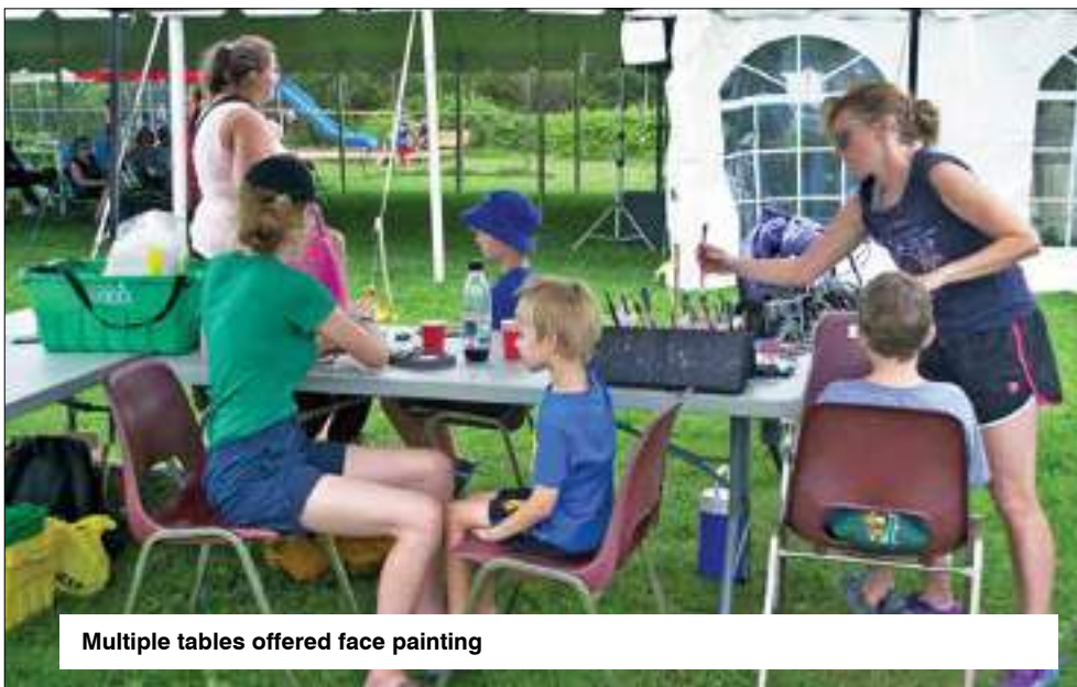
Multiple tables offered face painting