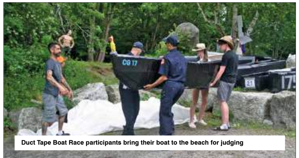
Duct Tape Boat Race participants bring their boat to the beach for judging