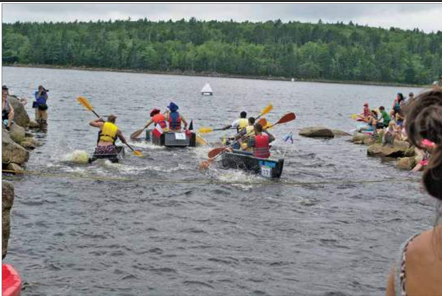
Spryfield Days Duct Tape Boat Race finalists set off in one last race to find the fastest boat. More photos on page 5