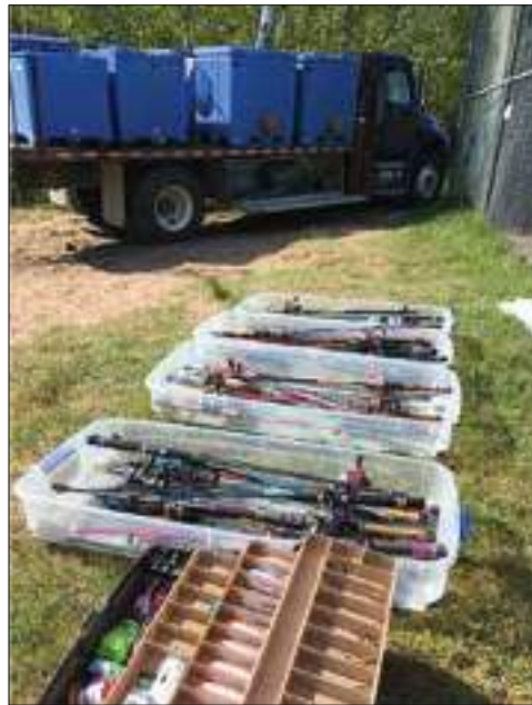
Trout-Truck from the McGowan Lake Fish Hatchery at Cunard Pond, on Williams Lake.