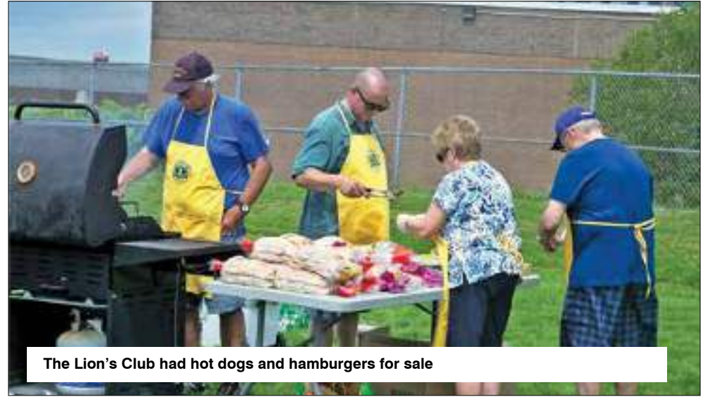
The Lion's Club had hot dogs and hamburgers for sale