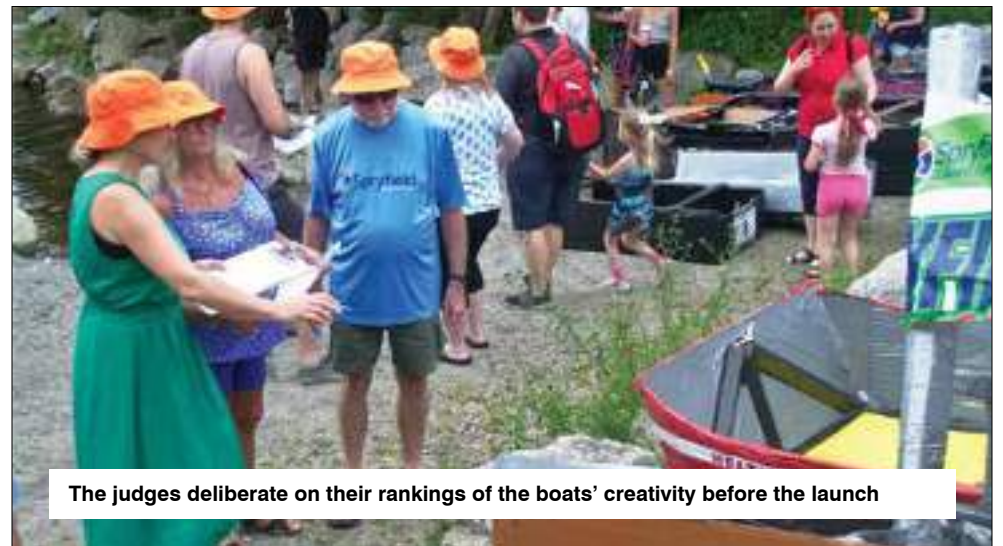
The judges deliberate on their rankings of the boats' creativity before the launch