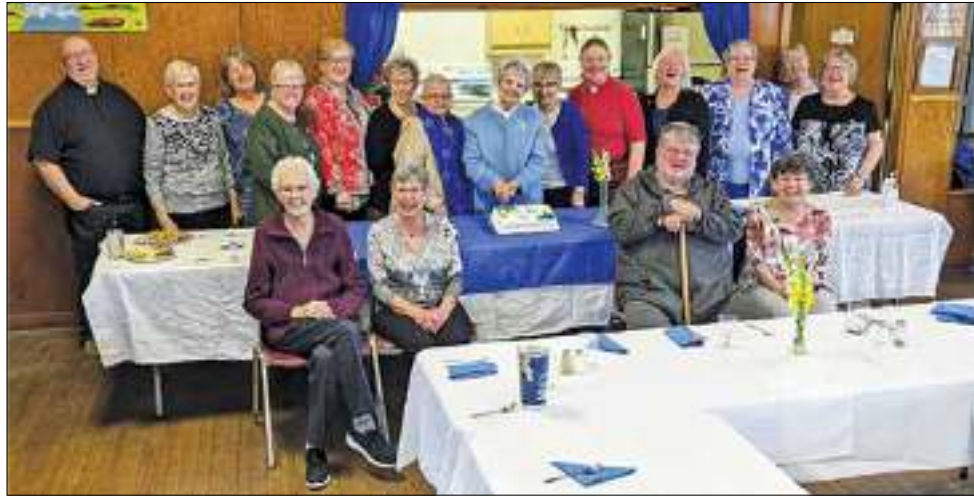
Members of Emmanuel Church's Mother's Union and guests gather on May 21 to celebrate 60 years of service in Spryfield.

The parish is proud to celebrate 60 years of the Mother's Union here in Spryfield.