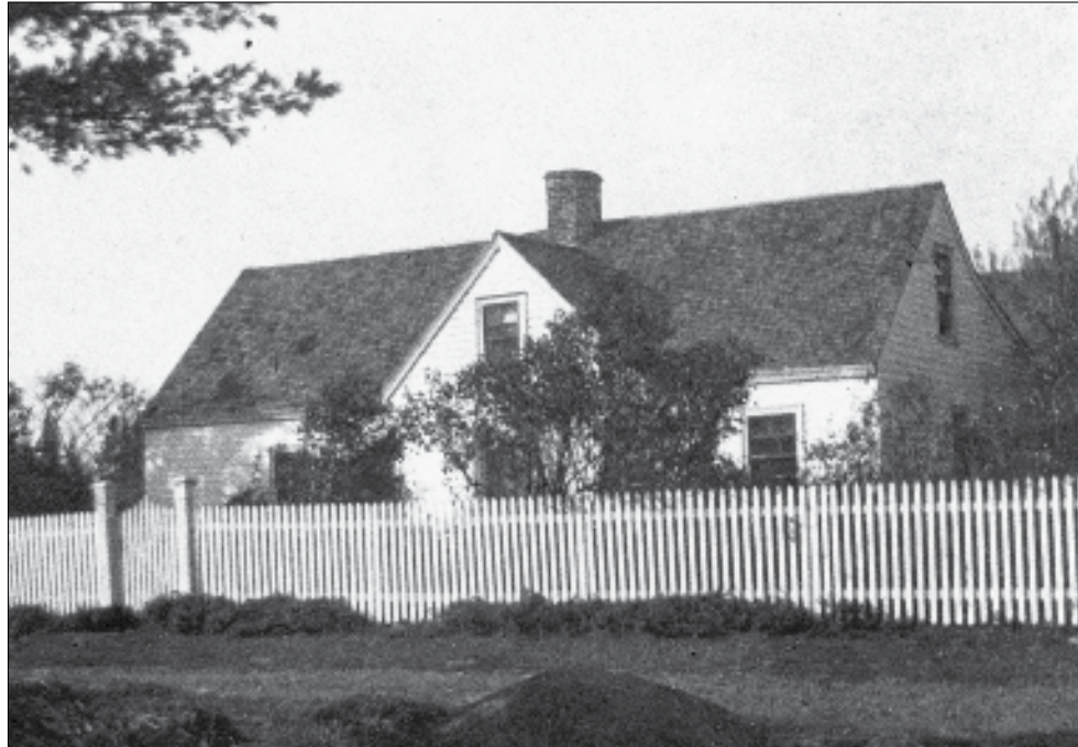
First Dart House at Dart's Fork, Old St. Margaret's Bay Road, about 1918. It was built in the 1850s and torn down in 1920

Between Old Sambro Road and Prospect Road there were three large farms. The 500 acre Dart Farm was established in the early 1850s and was located not far from the entrance to the Old St. Margaret's Bay Road. To find the entrance today, take the Old Sambro Road past St. Paul's United Church, and watch for an open space on the right, not more than one quarter