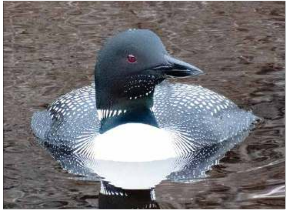
Classic Canadian iconic loon on Williams Lake