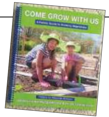
Don't miss out on this great book!

are so very fortunate to have had this partnership with the Rotary Club of Halifax Northwest since 2014. Their “Toonies for Change” fundraiser provided yearly financial contributions towards our CGWU programs. This year, in addition to a generous cheque for programming, they have taken on the huge task of rebuilding our 12 garden plots at the Urban Farm. Rotarians, a Citadel High student and 5 JL Ilsley students completed 6 beds on