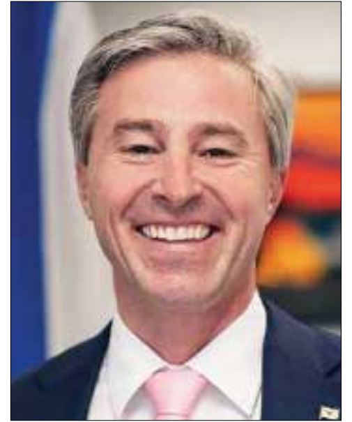
Premier Tim Houston

There are now 26 pharmacy clinics offering appointments for patients with common illnesses or who take medica-