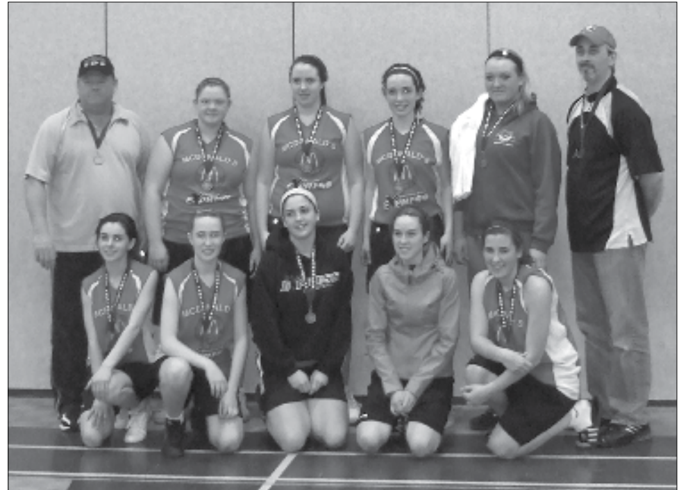
Mainland South Express Juvenile Girls, Division 2 basketball team, following their silver medal win in Provincials.