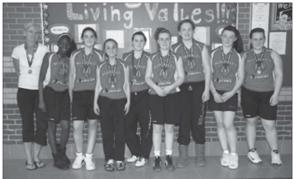
Bronze Medal winners in Provincials

The atmosphere was pleasant with many favorable comments for future events such as this one. The turnout and response was great from the communities and helped to show the "center" as a vibrant and accessible key component of the loop, proving it may be used for many and all venues.