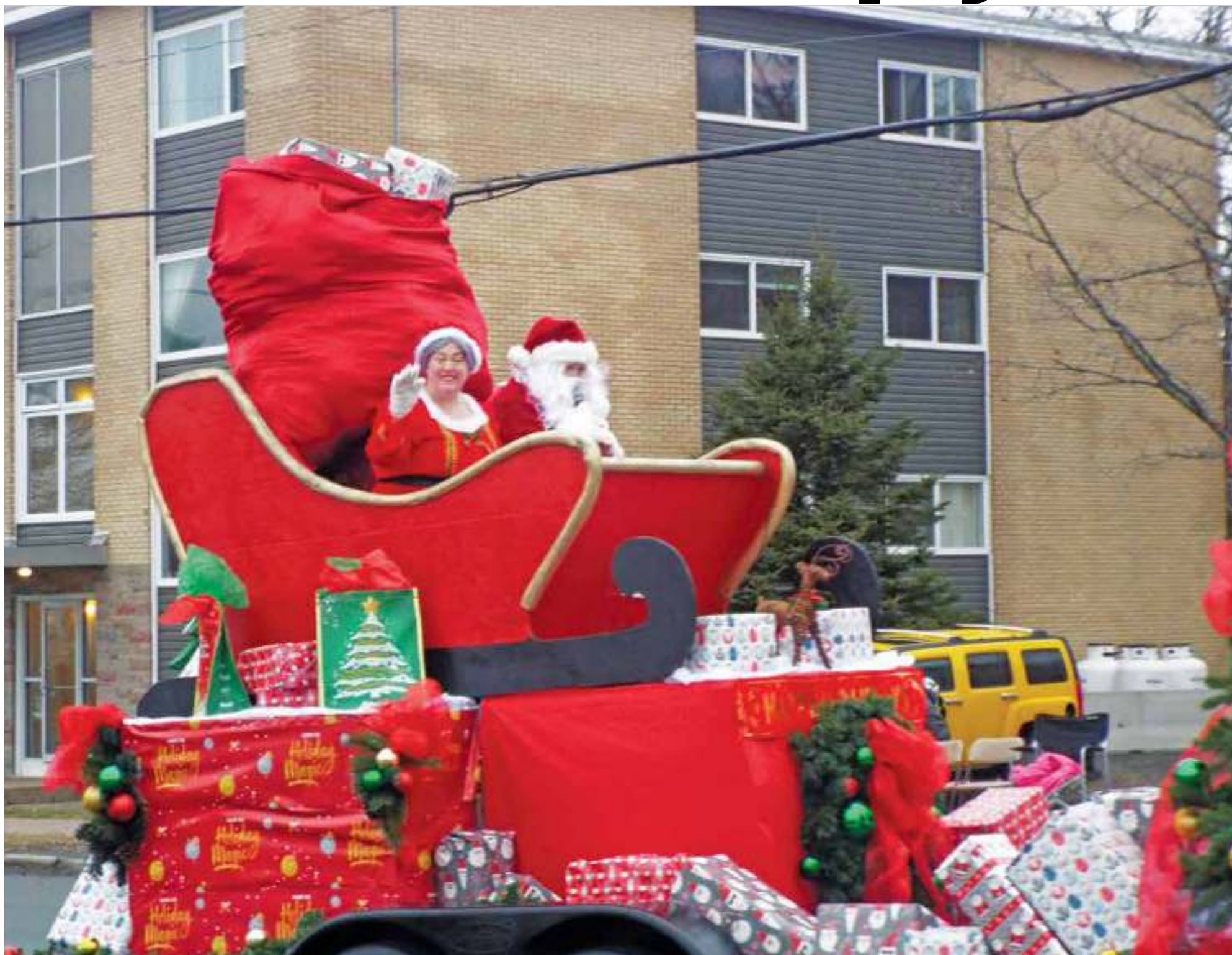
Santa and Mrs. Claus came to Spryfield on November 25 to join the annual Santa Claus parade. More photos on page 9.