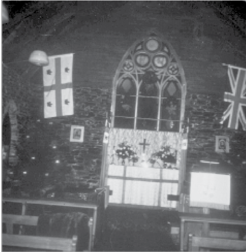
Photograph ca. 1950, interior of St. Augustine's Church at Christmas.